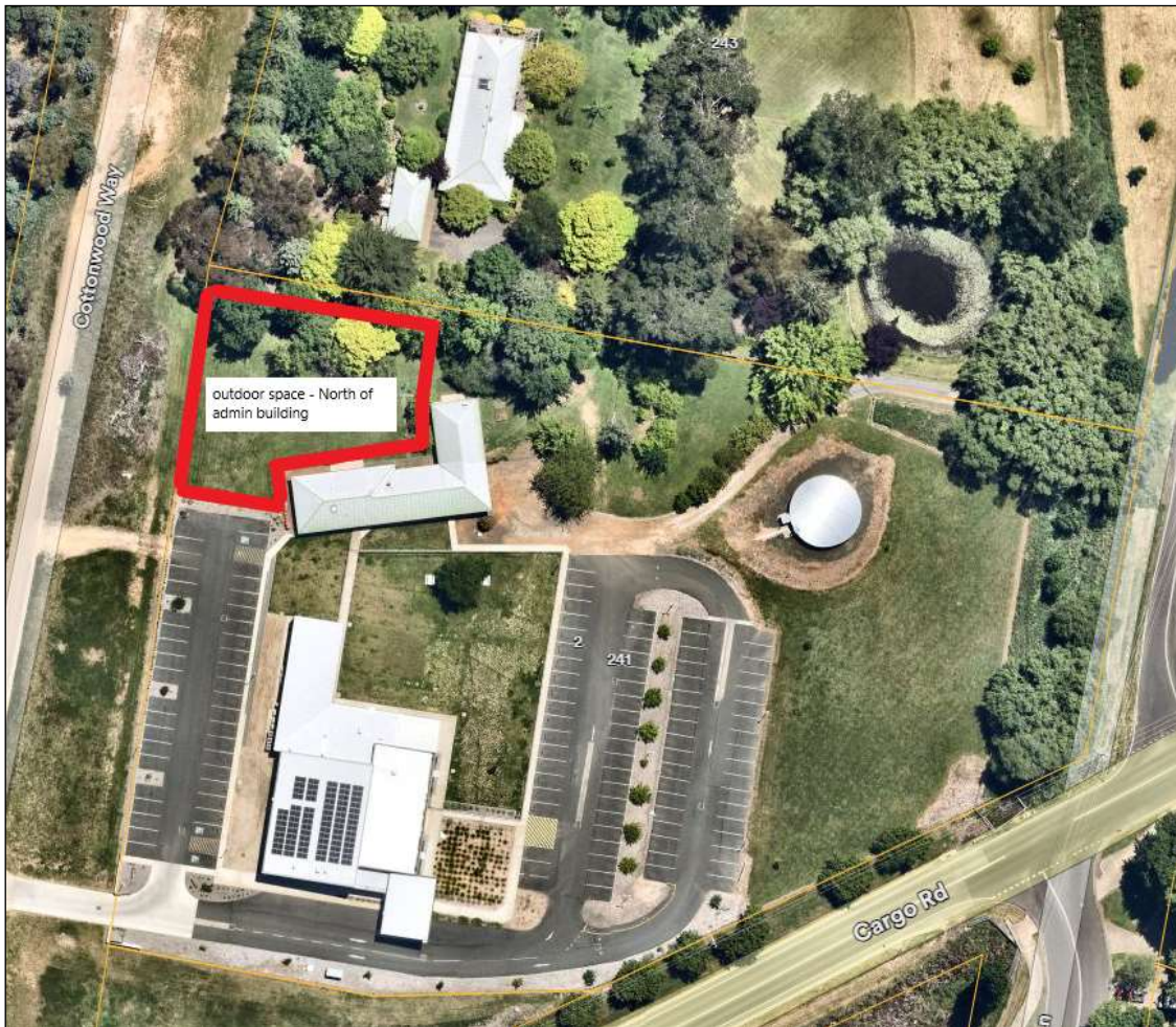
Figure 3 - image indicating Space A