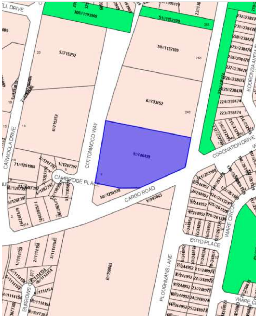
Figure 1 - locality plan

Application has been made to modify development consent DA 405/2017(5) for a proposed place of public worship and business identification sign at Lot 9 DP 746439 - 2 Cottonwood Way, Orange.