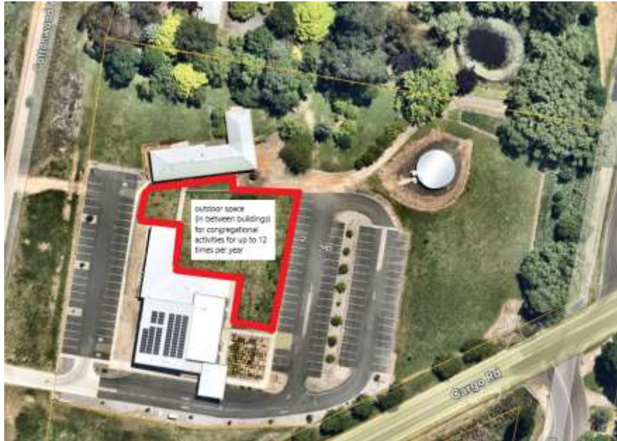
Figure 4 - image indicating Space B

Further to the assessment outlined above, development assessment staff met with the applicant on 5 December 2024 to clarify the purpose of the proposed operating hours. It was emphasised to staff that the extended hours would enable members utilising the space to set up and pack down after community events. The applicants advised that all planned events would be designed to be completed by 10pm. Additionally, it was noted that most members involved are volunteers who participate in activities outside typical working hours.